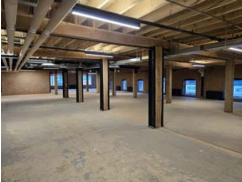
4th Floor of Revillon Building